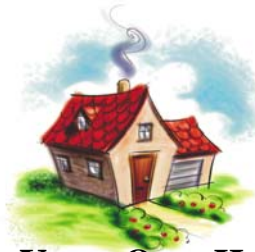
OWN YOUR OWN HOME